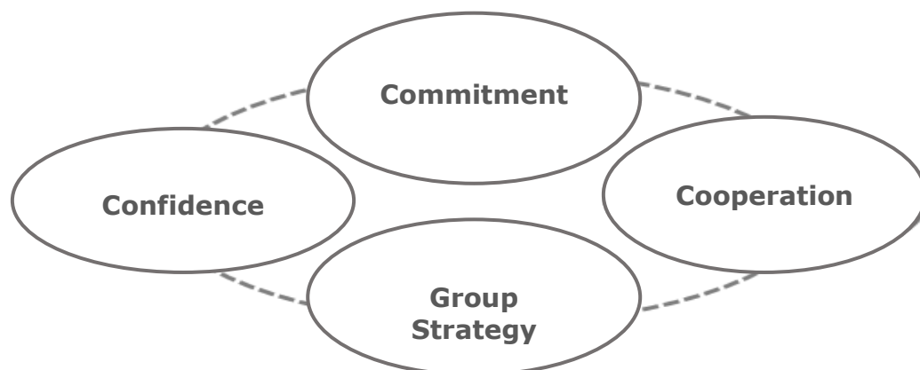
Figure 1: Social Aspects related to network competitiveness.

Besides the group strategy to compete as network, this research focuses only social aspects – confidence (trust), commitment and cooperation, likely to exist in an inter-organizational network, as shown in Figure 1. The purpose is to understand how these associated social aspects affect the network competitiveness.